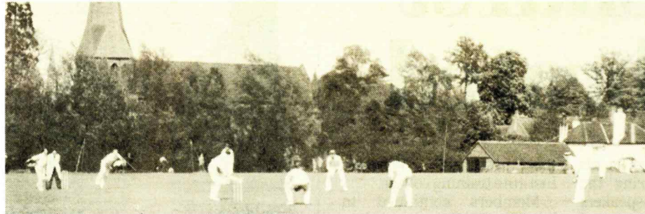
An historic view of Horsham cricket field.

A railway borders it, the church steeple rises attentively at one end and a green, wooded hill rises beyond at the other. Yet, here, right in front of you stand these derelict buildings in utter decay, their dilapidation a tangible reproach to