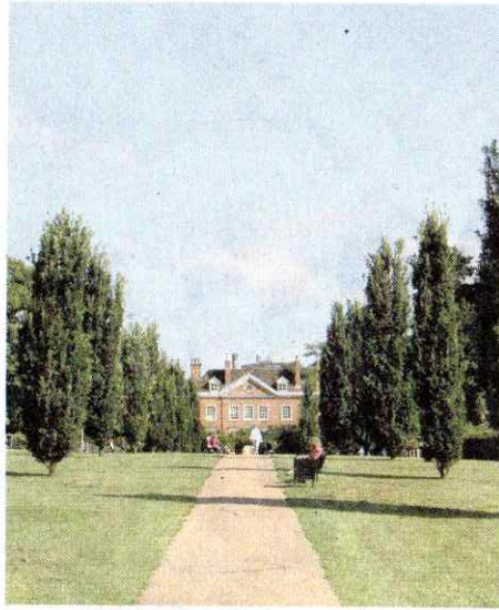
Top of the list is Horsham Park.

These children are excellent ambassadors for our town, extolling the virtues of Horsham and saying that much could be done for little or no cost.