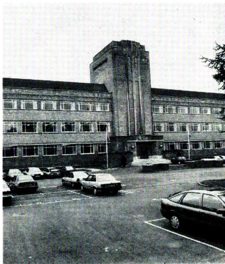
An historic view of part of the Novartis site.

Horsham needs sites that will provide more local jobs within 5 years; maybe requiring 14 to 17 ha now; not the "possible" 47ha suggested over 20 years. The employment objective should be phrased