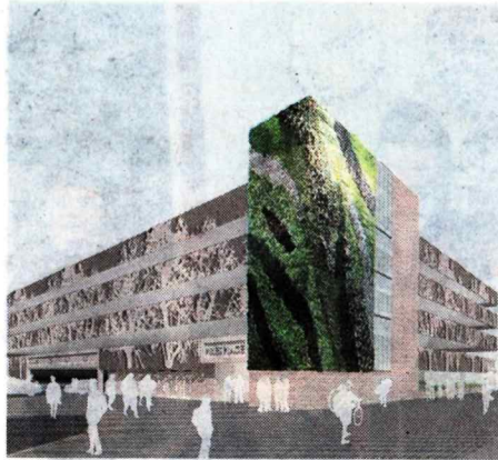
An artist's impression of the proposed new car park for Piries Place.

Five storeys will be above this, and the proposed steel mesh fence will dominate the skyline with its vertical support posts giving the impression of a 'fence in the sky'.